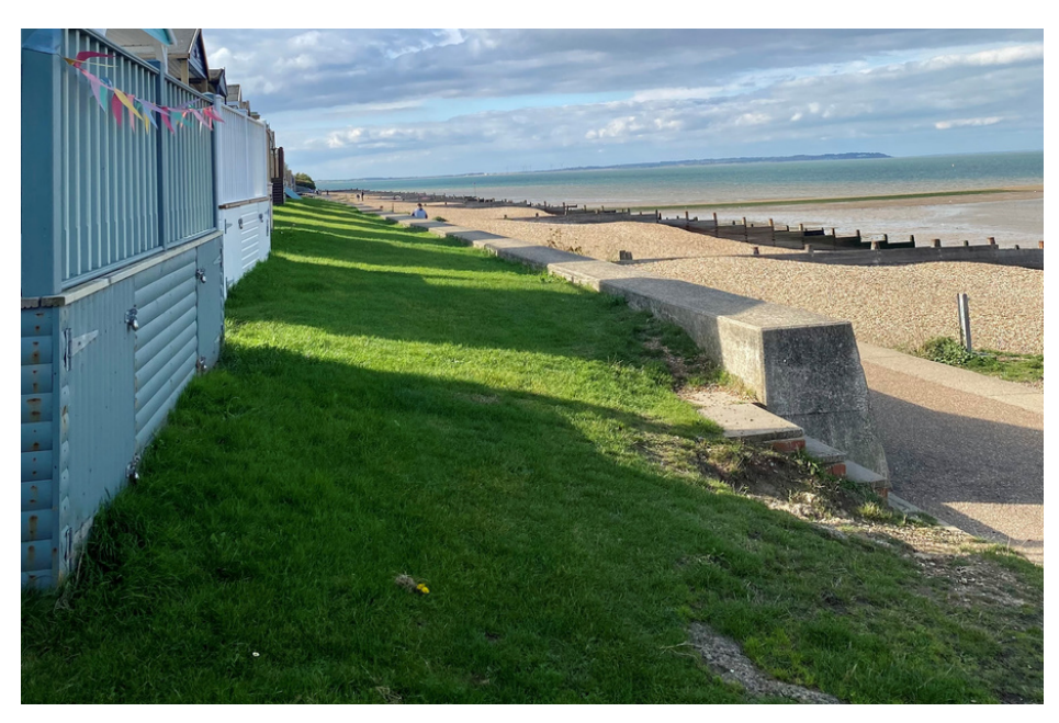
Sunny Whistable: the location of our Annual Conference