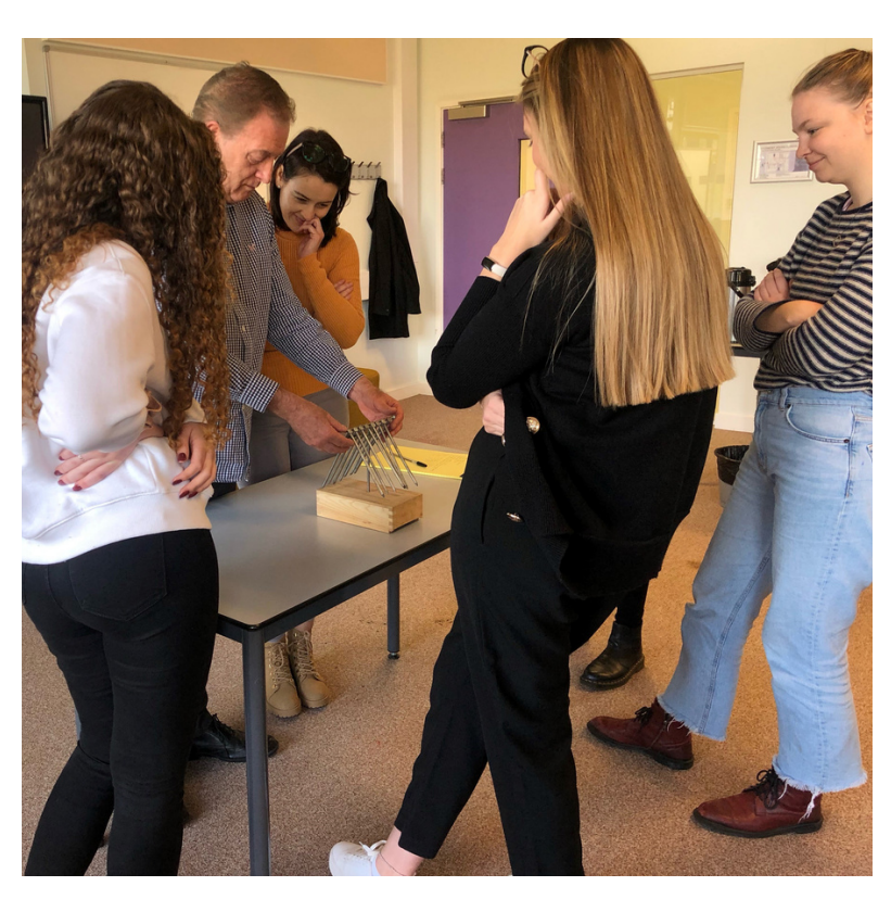
MLP Participants working together to solve a team building puzzle

Each session is designed to allow participants to become comfortable and feel empowered in their role, and provide them with the tools they need to go back to their schools and manage, lead and inspire their teams.