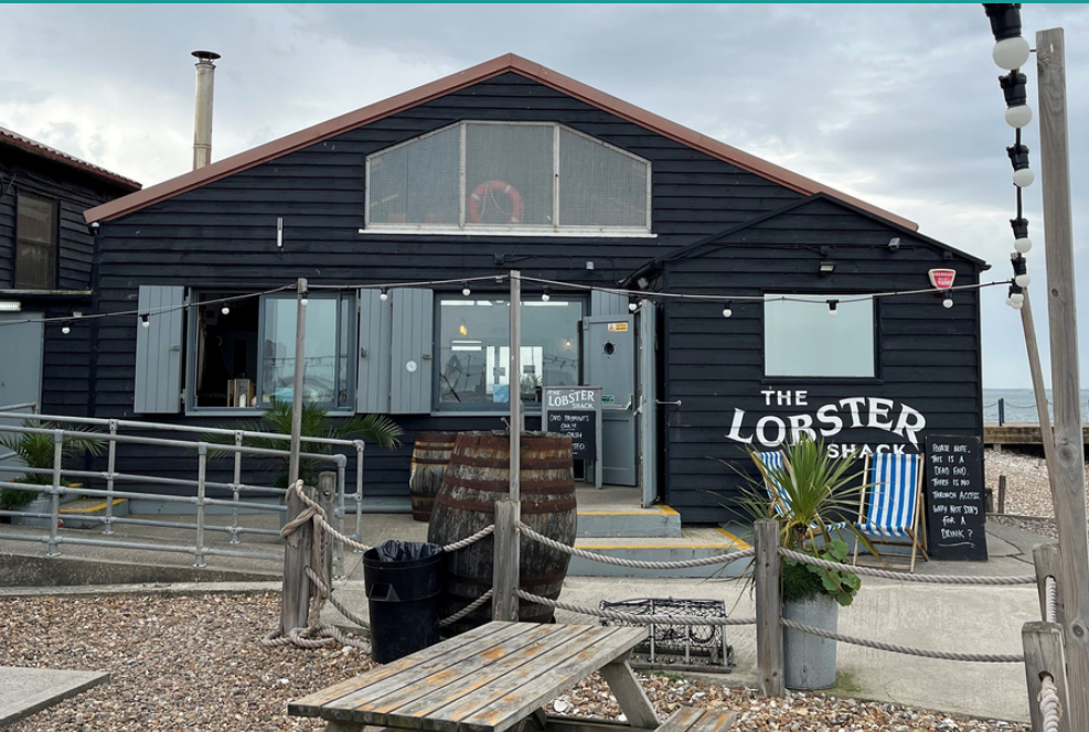
The Lobster Shack in Whitstable - Annual Leadership Conference

HTSA HACKNEY TEACHING & SCHOOLS' ALLIANCE