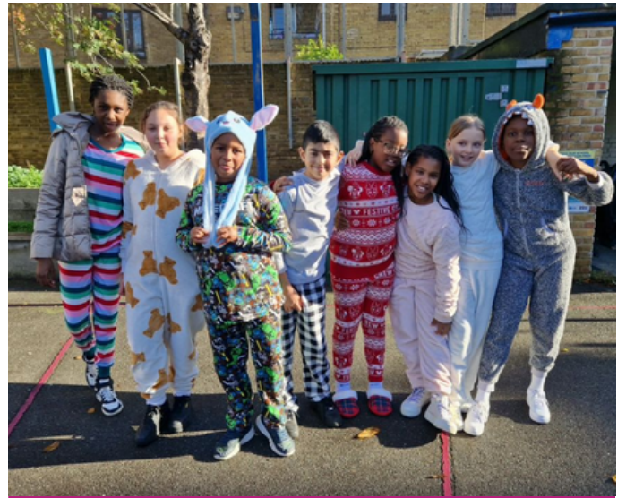
Children in Need Day at Randal Cremer Primary School