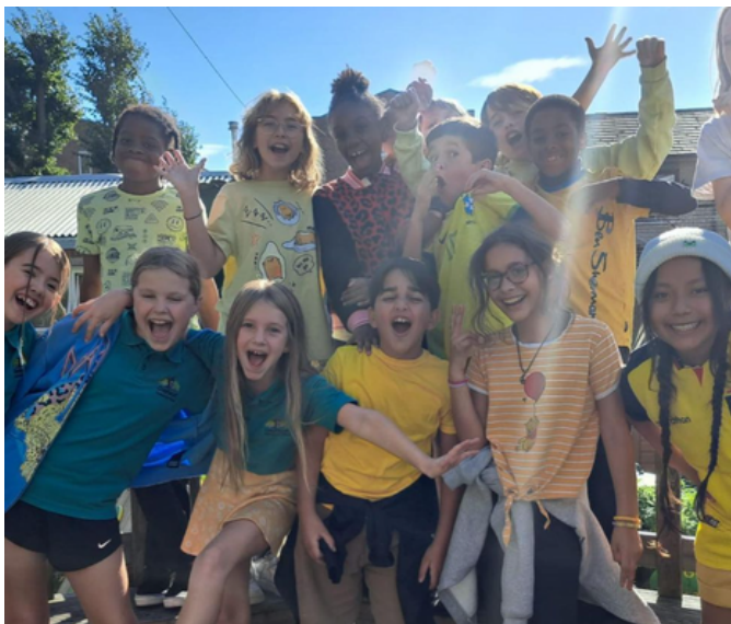
Celebrating World Mental Health Day in yellow at Gayhurst