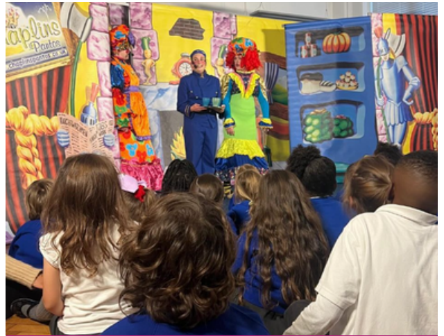
Panto comes to Mandeville Primary School