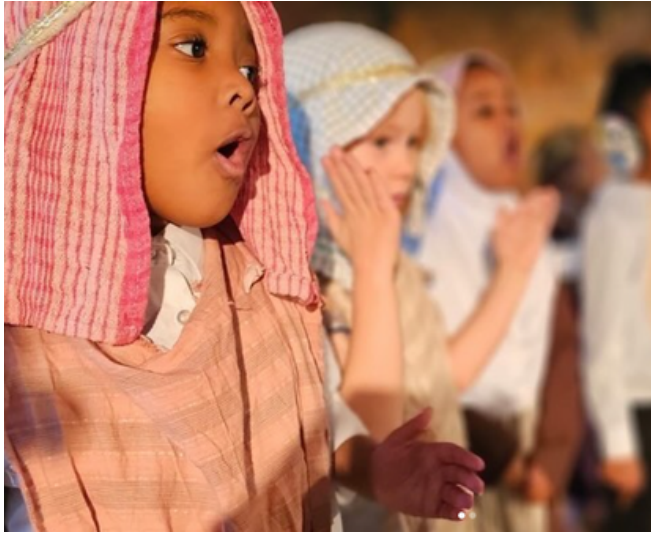
Year 1 Nativity at Kingsmead Primary School

Here are some of our favourite images from this term!