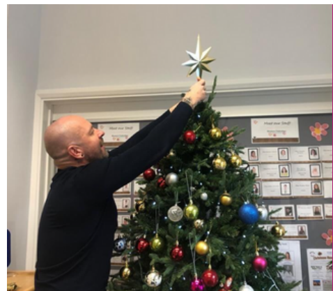
Decorating the tree at the Blossom Federation