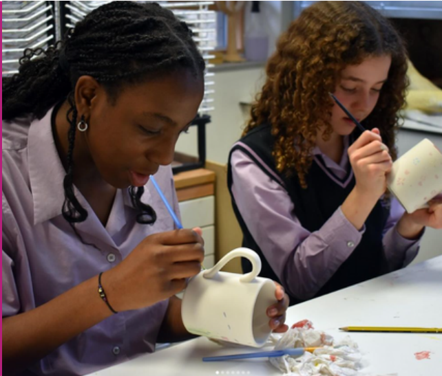
Mug Painting Workshop at Clapton Girls' Academy