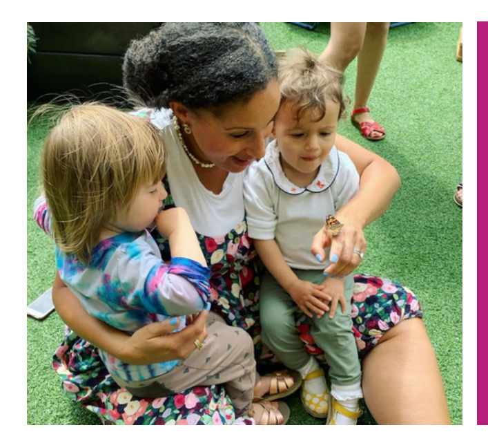
their beautiful butterflies into Wentworth children released the wild!