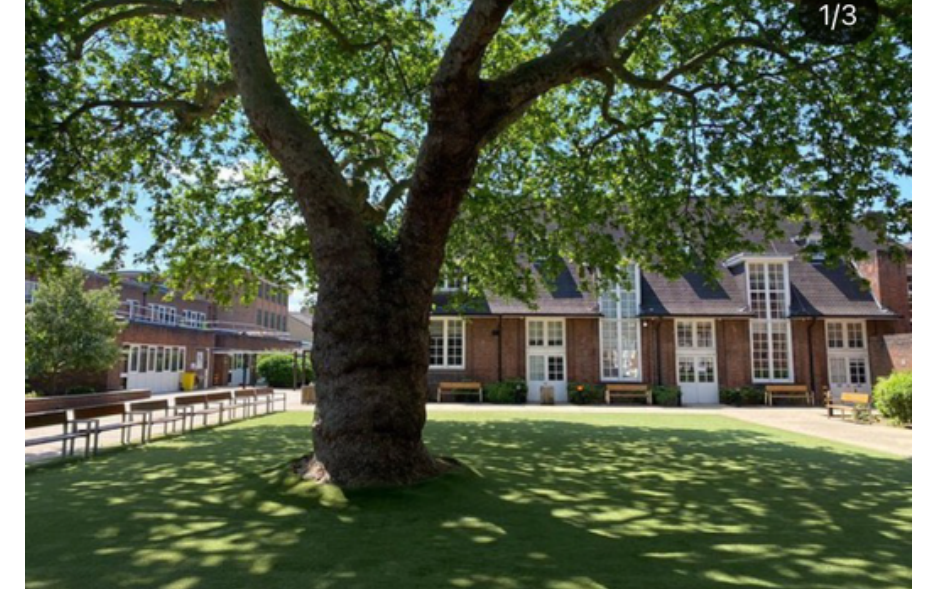
Clapton's recently refurbished courtyard shines in the sun

Course Feedback HTSA Updates Brownie Competition Debating Competition News and Events